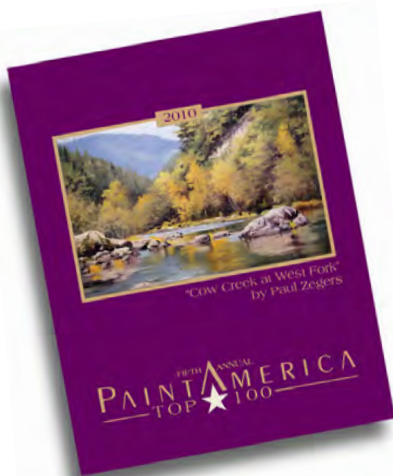
2010 Viewbook shown

6. Benefits. The benefits of this agreement shall inure to the benefit of the heirs, successors, and assigns of the respective parties.